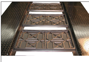
FOUR (4) DRIP TRAYS