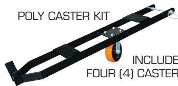
POLY CASTER KIT