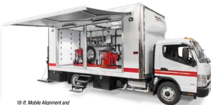
18-ft. Mobile Alignment and Wheel Service Box Truck shown