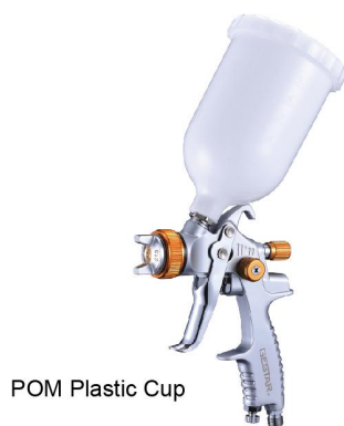
POM Plastic Cup