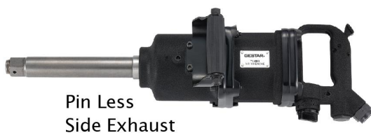
Pin Less Side Exhaust

Square Drive : 1" Anvil : (771-836) 6-1/2" (771-838) 8" Torque Range : 1,000 ft-lb (1,400 Nt-m) Max. Torque : 1,500 ft-lb (2,000 Nt-m) Free Speed : 4,000 RPM Air Consumption : 15 cfm Air Inlet Thread : 3/8" PT Noise Level : 102 dB Vibration : 13.93 m/s 2