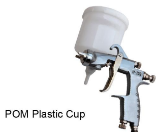
POM Plastic Cup