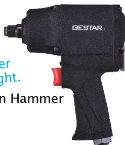
More Power Less Weight.

Square Drive : 1/2" Torque Range : 25-500 ft-lb Max. Torque : 800 ft-lb Free Speed : 7,500 RPM Air Consumption : 5.0 cfm Air Inlet Tread : 1/4" NPT-18, 1/4" PT-19 Noise Level : 85 dB