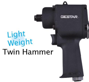
Light Weight Twin Hammer